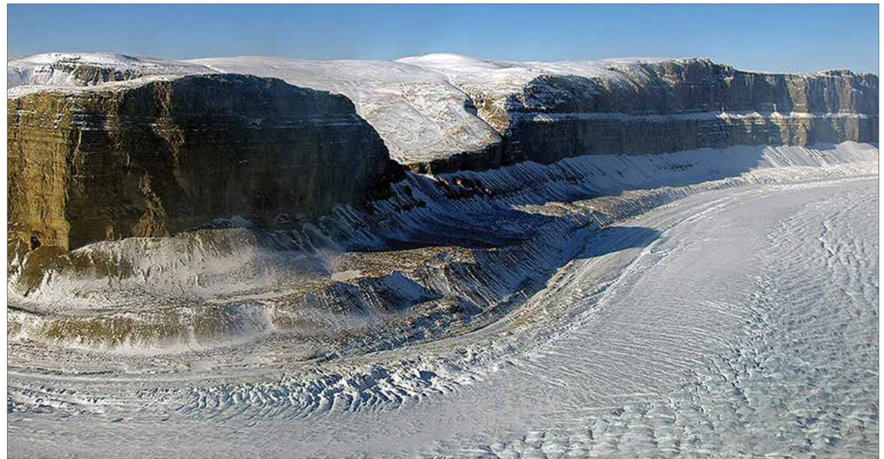
This view along Steensby Glacier in northern Greenland was seen during an Operation IceBridge survey flight on April 26, 2013.

More than 100,000 years old and up to two miles thick, the ice sheet has been waning in