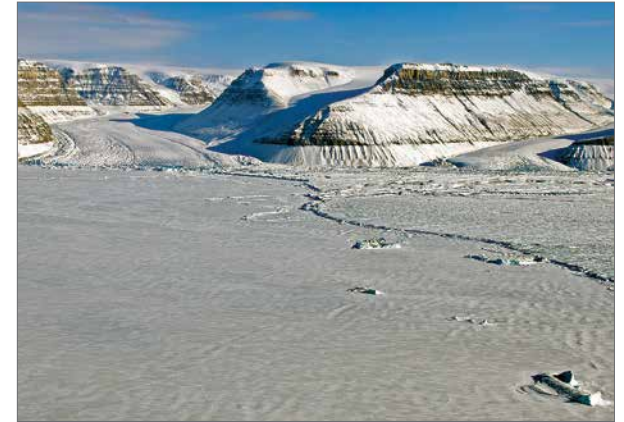
The calving front of Petermann Glacier in northern Greenland is seen from the NASA P-3B aircraft during Operation IceBridge. In July 2012, an iceberg twice the size of Manhattan broke off of Petermann Glacier and began to float away in the ocean. After this calving event, the line where the iceberg broke away became the glacier's new front edge, or calving front, effectively moving it several kilometers upstream. Several valley glaciers are now flowing into the fjord, covered by sea ice.

"So the previous maps we were using were not good enough to run the models at a higher resolution," Morlighem said. In addition, crevasses, rough terrain, and pockets of liquid water all