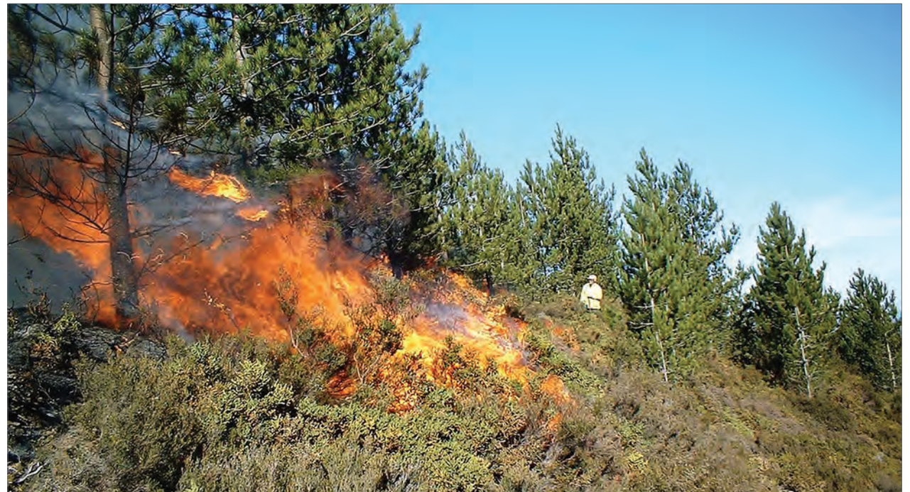
A prescribed fire is applied to a Pinus nigra stand in Portugal.

Scientists are piecing together a global portrait of how fire behaves around the globe, in anti-