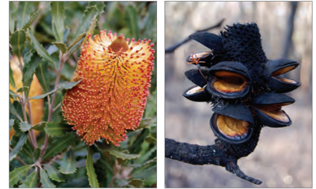
This photograph shows Banksia media before and after a fire.

“We want to understand how productivity in ecosystems influence fire activity on a global